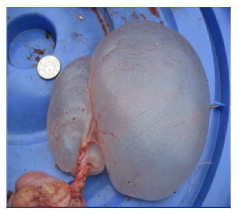
Figure 3: A thin walled cystic oviduct

In a large number of these 'false layers' a new variant of IBV was detected; early infection with this variant has been seen to result in a failure of the oviduct to develop, despite the other characteristics of sexual maturity occurring normally ( Figure 4 ). The GD – Animal Health Service in Deventer, Netherlands, has typed this IBV variant as D388. This strain has been confirmed as being identical to the QX-like variant, which was typed and described in China in 2004.