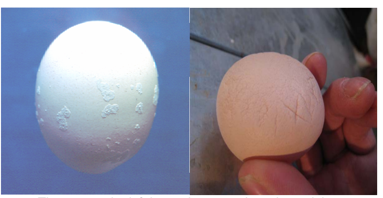
The egg on the left has calcareous deposits and the egg on the right a soft shell.

Internally the albumin of the egg may become thin and watery with no clear distinction between the thick and thin albumin.