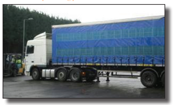
Figure 4: Example of a vehicle suitable for transporting broilers to the processing plant.

Transportation vehicles ( Figure 4 ) must provide adequate protection from the weather, appropriate ventilation, and comply with local current legislation.