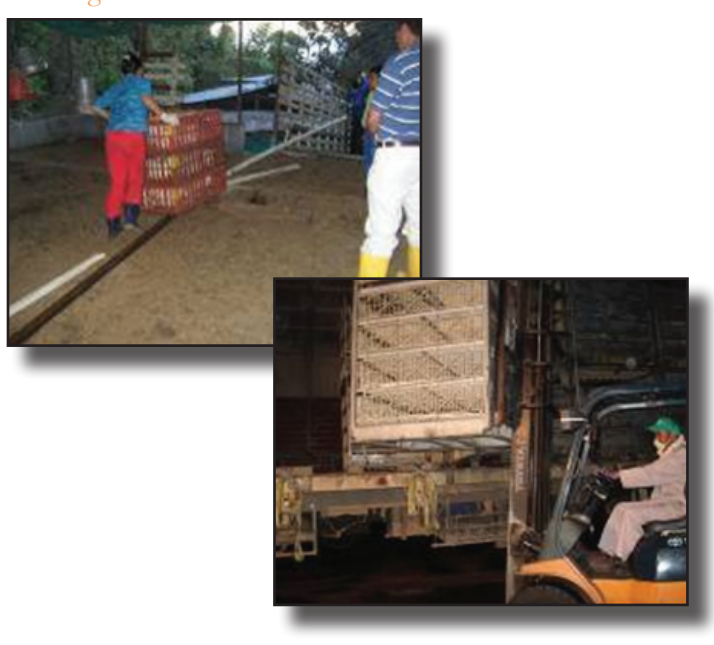
Figure 3: Using a forklift or PVC pipes to ease manual catching.

Catching crews must be properly trained in bird handling and welfare. Birds should be caught carefully, and held by both shanks, or by the breast with both hands to minimize distress, damage and injury (e.g. bruising or hip and wing dislocations). Clear guidelines on bird handling must be in place and the catching process should be monitored and reviewed regularly.