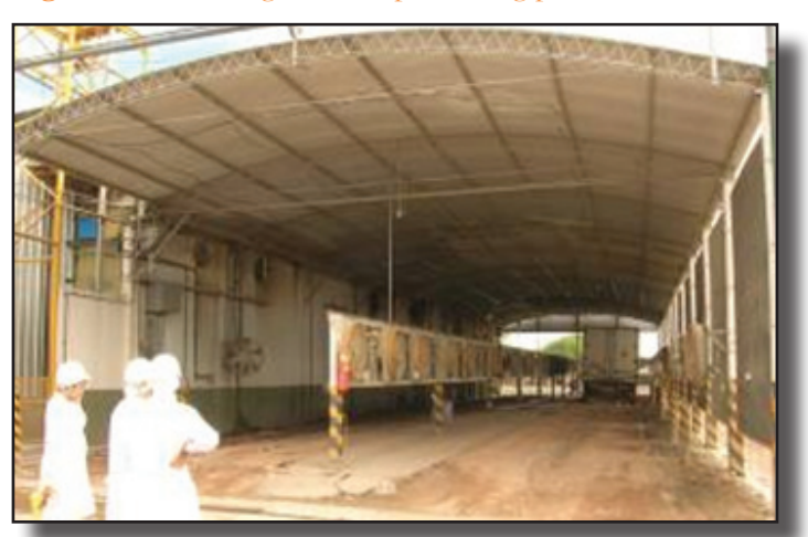
Figure 5: A holding area at a processing plant.

Fans can be used to help keep the birds cool and well ventilated in the holding area ( Figure 6 ). Fans should be positioned carefully to ensure good even airflow through the crates. Appropriate spacing between the trucks, or inserting empty modules into the bird compartment of the truck, will help improve air-flow around the birds.