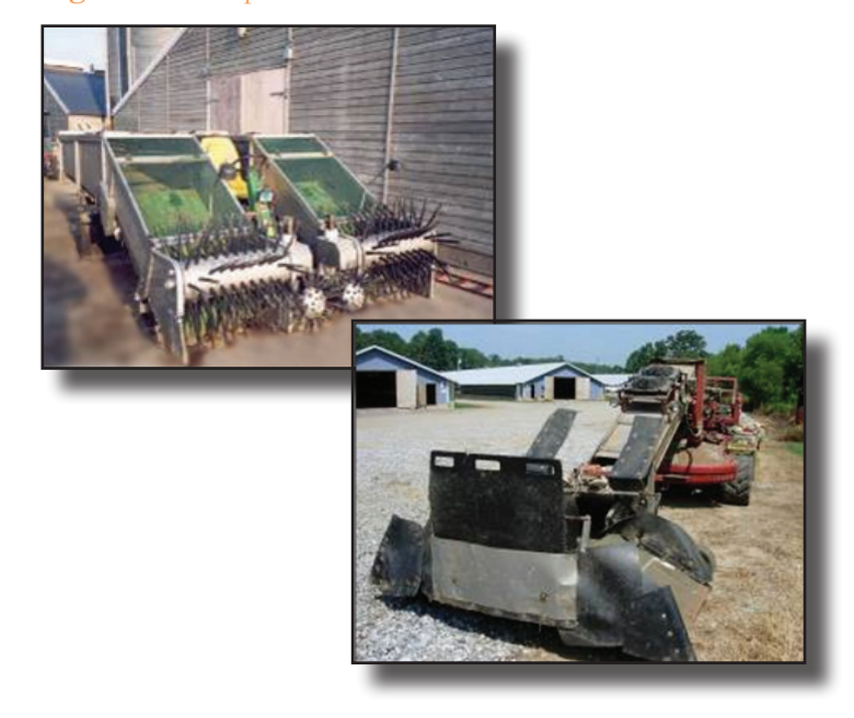
Figure 2: Examples of mechanical harvesters.

Methods of manual catching vary from country to country depending on equipment and labor availability. Manual catching crews typically catch and crate between 7,000-10,000 birds an hour. However, personnel can be subject to fatigue and may perform inconsistently during a shift. The use of forklift trucks to bring transport modules into the house, or PVC pipes to aid movement of transport modules through the house ( Figure 3 ), can make manual catching easier.