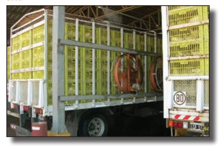
Figure 6: Fans being used in the holding area to keep birds cool.

During periods of high temperature, foggers can be used to help keep birds cool. Foggers must be well-maintained, and should not be used when relative humidity is greater than 70% because the capacity of birds to lose heat will be compromised. If foggers are used, it is important to make sure birds are dry when placed on the processing line. If birds are wet, the effectiveness of the electrical bath stunner may be reduced compromising bird welfare and carcass quality.