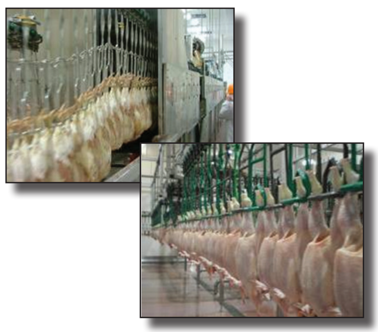
Figure 1: Clean birds showing no signs of fecal contamination on the processing line.

Feed withdrawal plans should be monitored and reviewed constantly and must be modified promptly if problems occur, but as a general rule of thumb, feed should be removed from the flock 8-12 hours before the expected processing time.