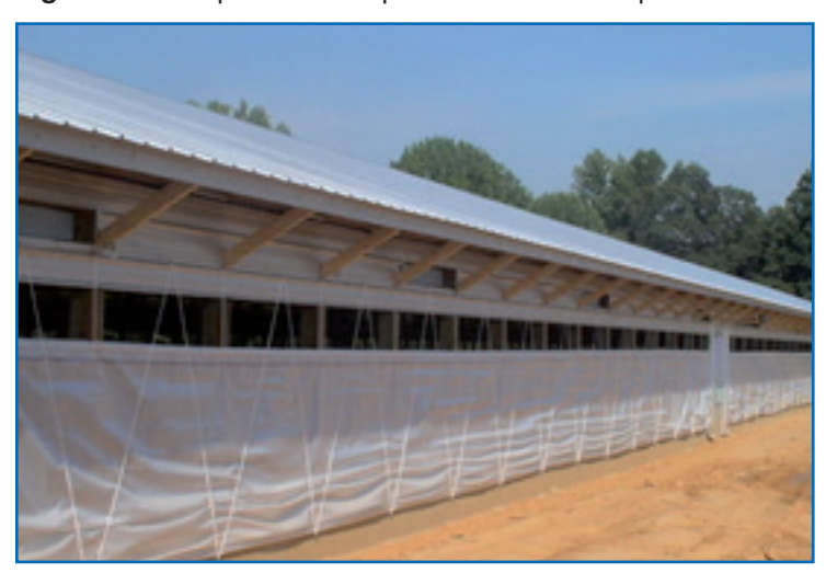
Figure 3: Example of a roof painted white to help reduce the heat load for the house.