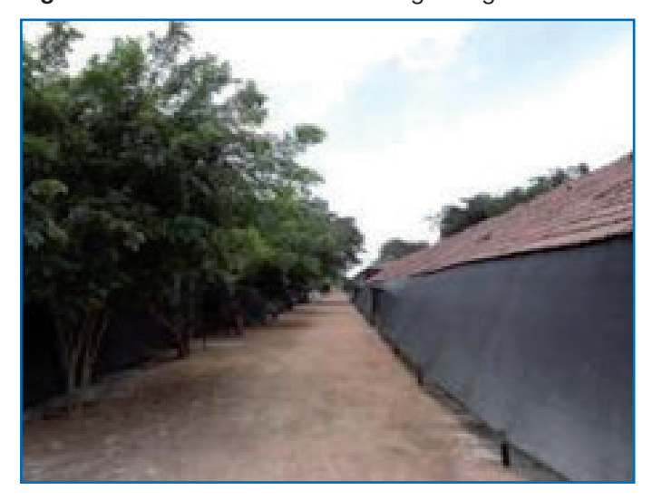
Figure 7: Houses with black nets for growing birds out-of-season or for flocks exposed to increasing daylength during rear.

Where birds are reared in open-sided houses, black nets or curtains ( Figure 7 ) can be used to manage the birds during out-of-season flocks or flocks that are exposed to increasing daylengths during the rearing period. Using the black nets reduces the light intensity in the house but will also affect the normal flow of air in the house. This will increase the heat and humidity discomfort of the birds, especially during the hot season or when the outside temperature and/or humidity increases. Fans are essential in rearing houses to keep the birds comfortable and reduce the potential of heat and humidity discomfort.