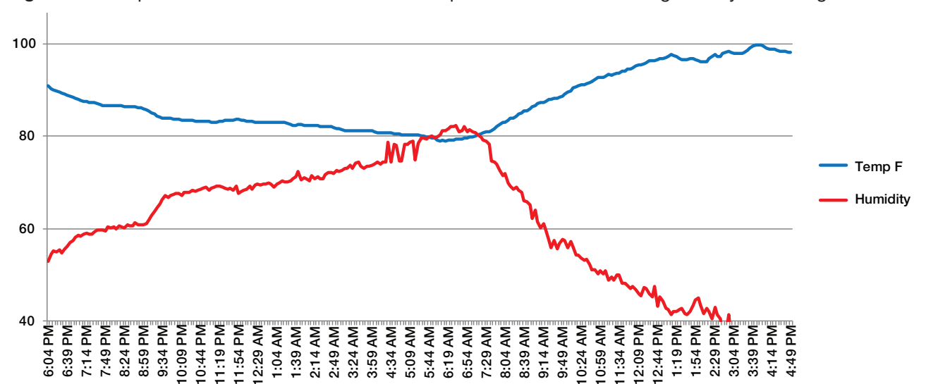
Figure 2: Example of the rise and fall of ambient temperature and % RH during the day and at night.

The effect of high temperatures will increase when humidity levels are also high. In general, environmental temperature rises during the day while % RH falls, with the opposite effect at night (temperature falls while % RH rises) ( Figure 2 ). Therefore, during the hot season, it is possible for birds to feel the effects of heat and humidity discomfort at any time, making it even more difficult to regulate body temperature.