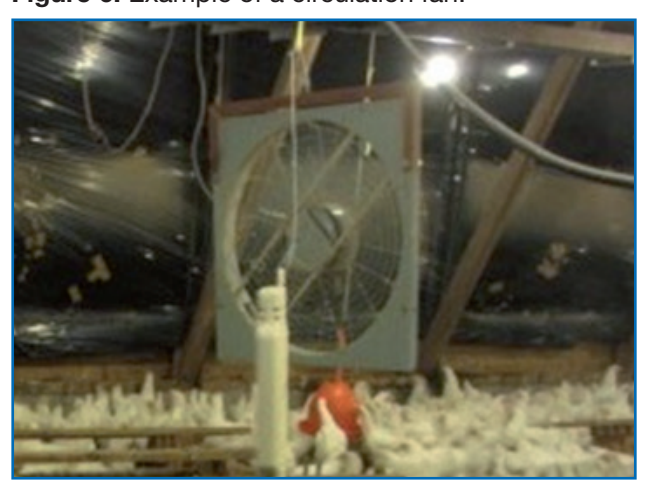
Figure 6: Example of a circulation fan.

During the hot season, the use of fans ( Figure 6 ) in conjunction with foggers is recommended to help improve performance and reduce mortality levels. The primary purpose of circulation fans is to provide air movement over the birds in order to remove body heat. Heat is removed from the bird and the house when air speed is increased. Circulation fans should produce an air speed of at least 2 meters per second (395 feet per minute) at bird level. It is essential that birds are exposed to adequate air movement with no or few dead air spots in the bird area. Running fans during both the day and the night will help to keep the birds more comfortable.