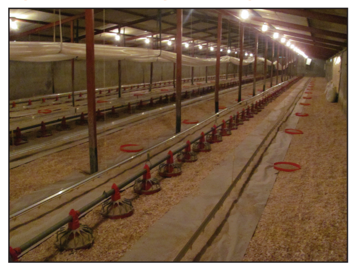
Figure 2: Example of a good brooding set up.

Due to genetic improvements in daily live-weight gain, the brooding period (the first 10 days of a chick's life) now represents almost 25% of the total life of a flock. The brooding period is a critical time for the development of a fully functioning and active gut which is able to convert feed efficiently. Having the correct brooding management in place (Figure 2) is therefore critical to lifetime performance and efficiency of feed utilization.