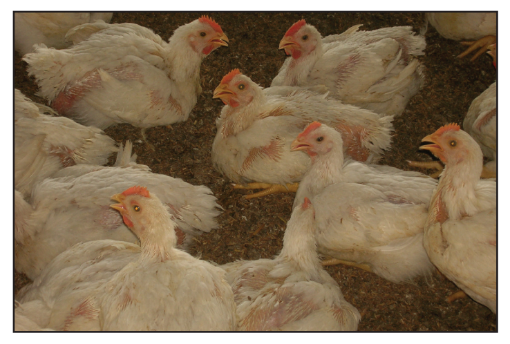
Figure 3: Heat stressed birds.

slow and flock FCR will again be increased (Figure 3). If relative humidity is high, problems of high environmental temperature are made worse as it is becomes more difficult for the birds to lose excess heat. To compensate for this, dry bulb temperatures will need to be reduced. If relative humidity is low then dry bulb temperatures will need to be increased in order to maintain bird comfort. Monitoring bird behavior is critical for determining if environmental conditions are correct.