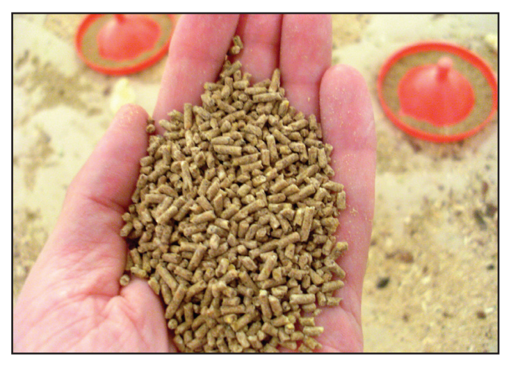
Figure 4: Example of a good quality pellet.